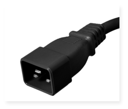
PVC POWER CORDS