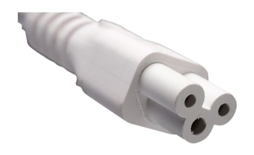
TPE POWER CORDS