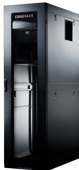
Figure 1 - EdgeRack 5M Series

Running the RCU on the battery backup will greatly reduce runtime for IT equipment also on the UPS.